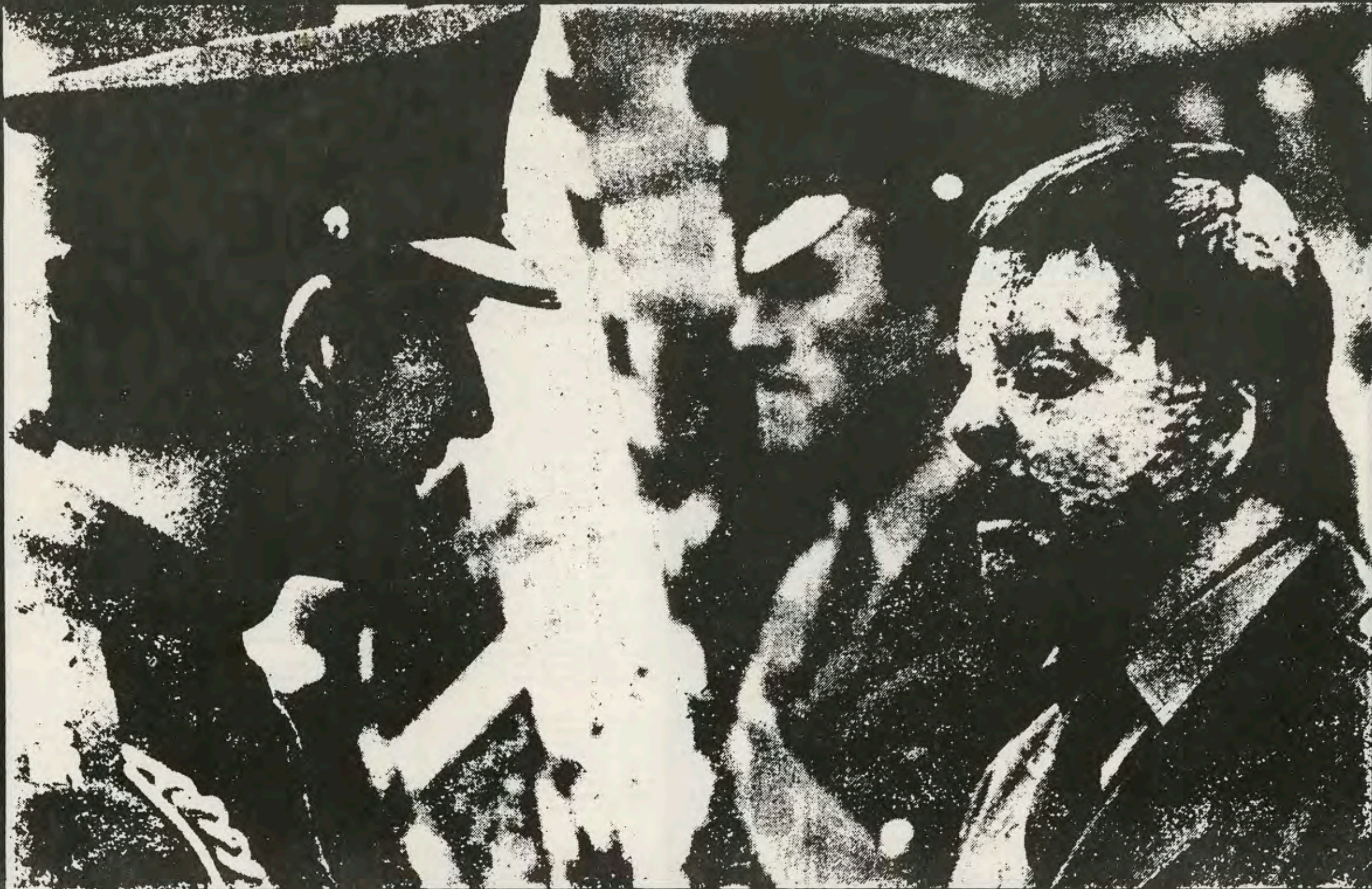
"Get well soon," the Prince said. And the heroic soldier replied: "Yes, sir, I will."