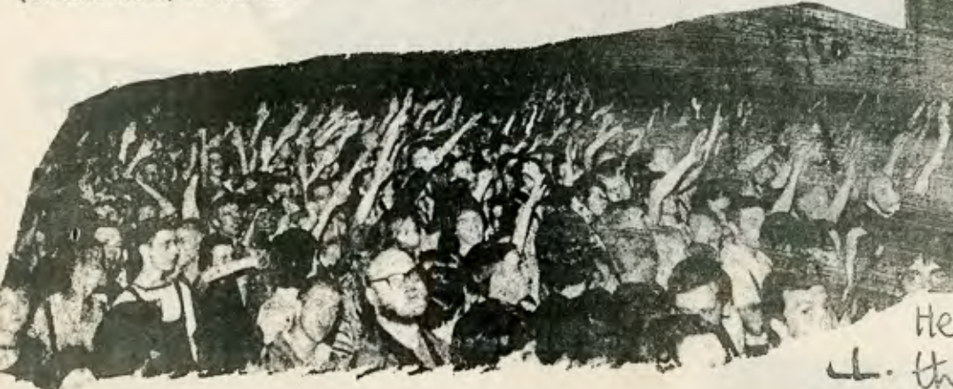
Headbanger Hitler..... the Philosophy lies on.....